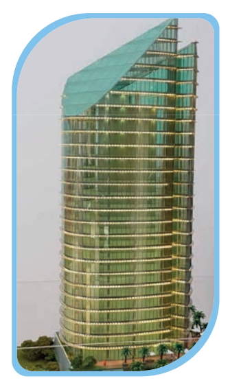
Entente Tower Abidjan, Ivory Coast